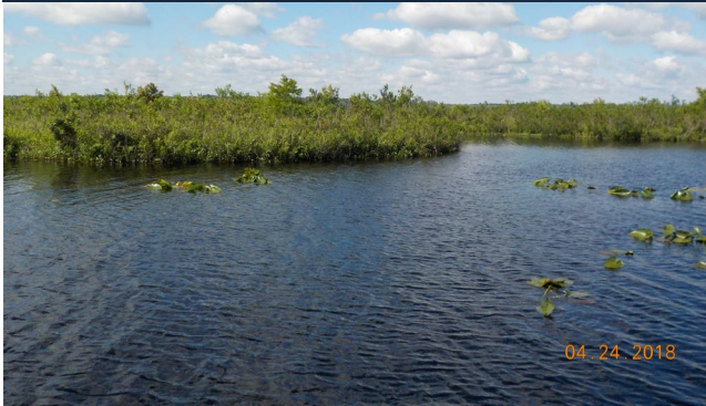
Figure 1. Station MI2. Note the open water surrounding the station in the second photo and the floating tussock islands in the third photo.