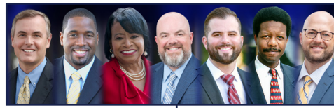
BOARD OF COUNTY COMMISSIONERS