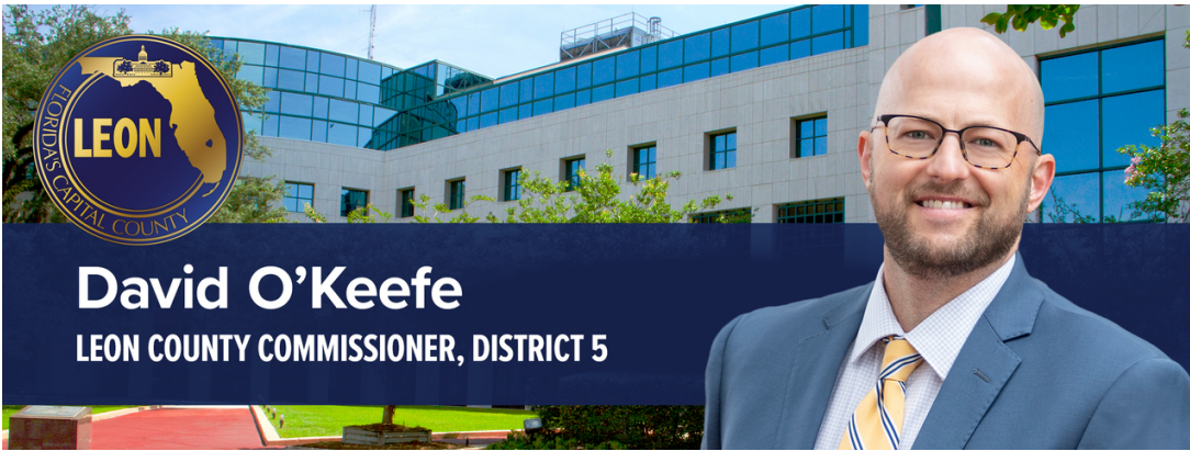
David O'Keefe LEON COUNTY COMMISSIONER, DISTRICT 5