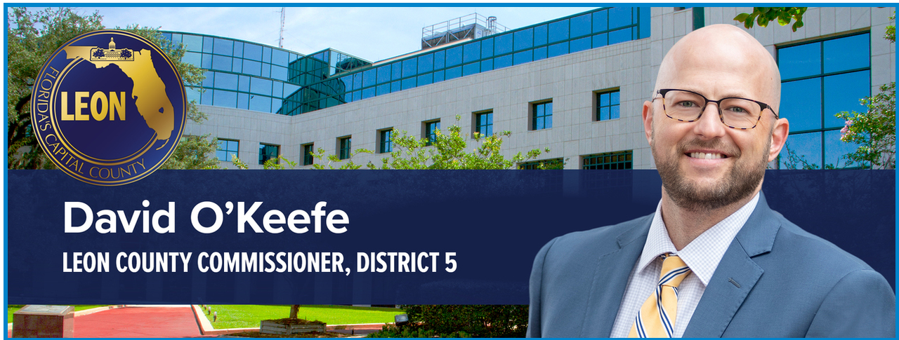
David O'Keefe LEON COUNTY COMMISSIONER, DISTRICT 5