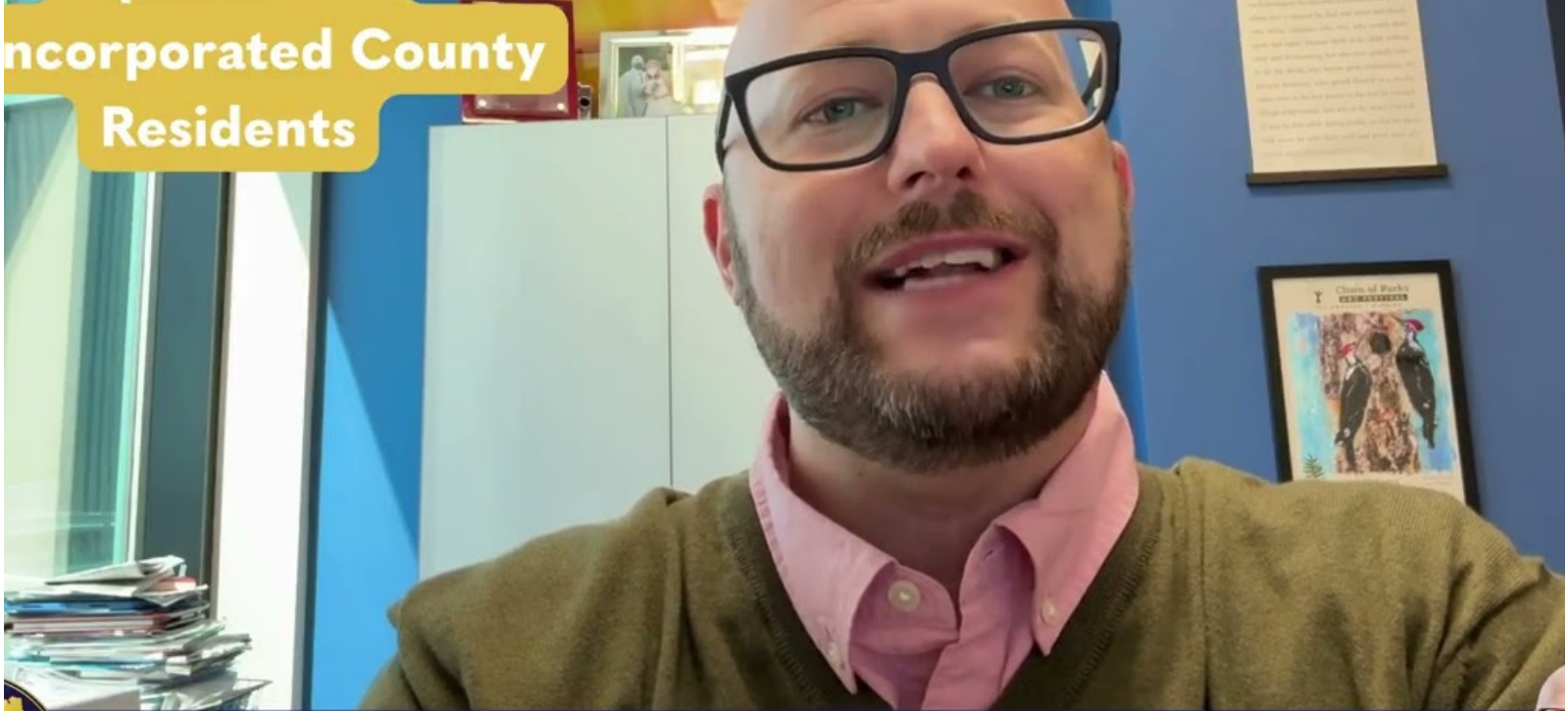
David O'Keefe Leon County Commissioner, District 5 @commishokeefe