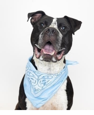
Spec 3 yr. old, male, Staffordshire Terrior