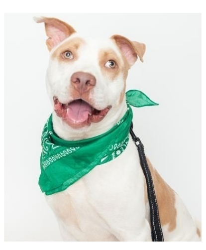
Marlin 1.5 yr. old, male, Staffordshire Terrior