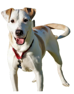
Abe 6 yr. old, male, Labrador Retriever/American Foxhound