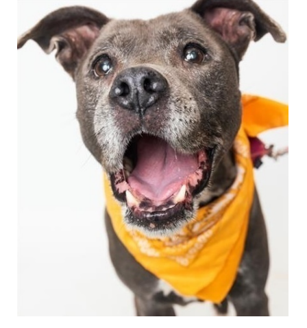
Blanche 6 yr. old, female, Staffordshire Terrior