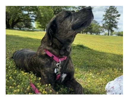
Primrose 6 yr. old, female, Tennessee Treeing Brindle Hound mix