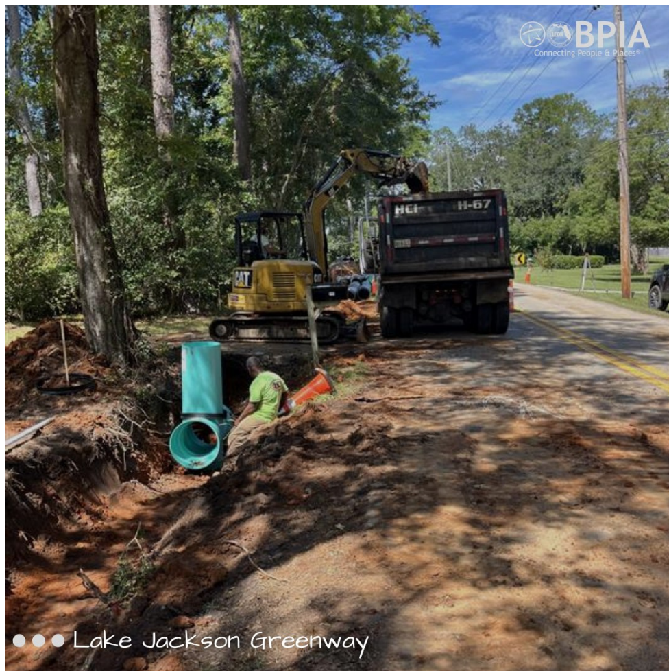
●●● Lake Jackson Greenway