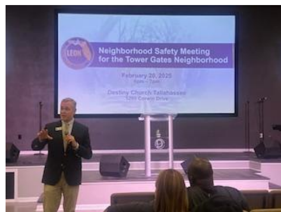
Tower Gates Neighborhood Safety Meeting