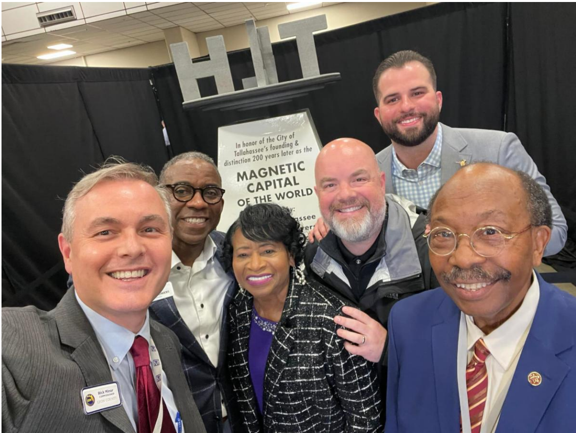
Posing with "Maggie," the world's largest levitating magnet sculpture, at the Motor Drive Systems & Magnetics Conference!