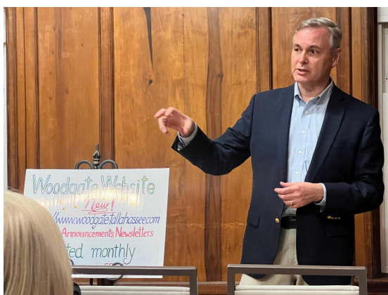
Woodgate Neighborhood Association Neighborhood Meeting