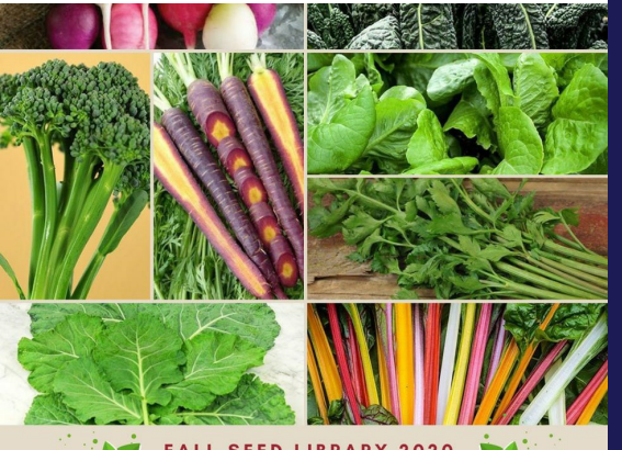
FALL SEED LIBRARY 2020

Click here to learn more and here for seed and planting information. Contact your library for more information.