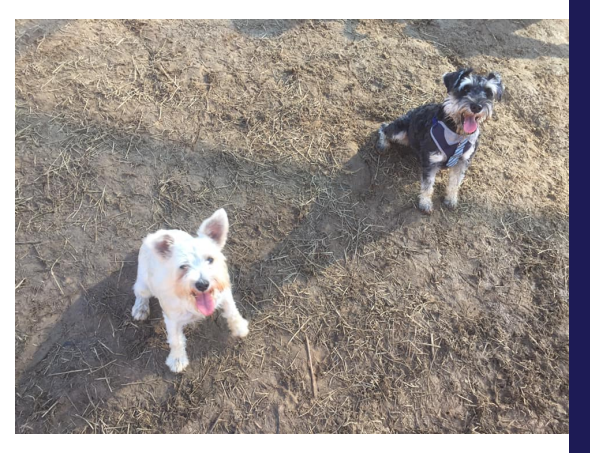
The Minor Family's Miniature Schnauzers -Eleanor and Delano.

Check out these tips from the ASPCA for simple steps you can follow now to make sure you're ready before the next disaster strikes: <u>https://bit.ly/2rkZwuG</u>