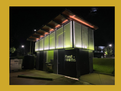
FAMU Way Restrooms