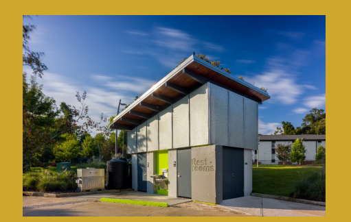
FAMU Way Restrooms