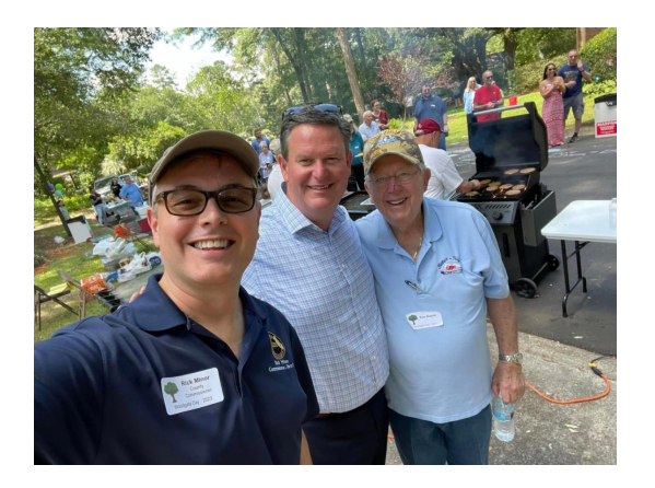
In Woodgate, a District 3 neighborhood celebrating its 50th birthday!