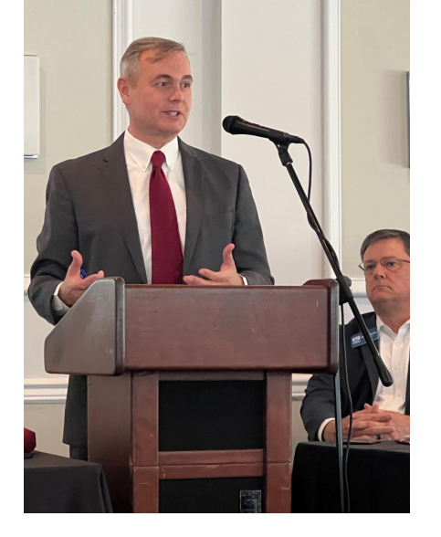
Discussing North Monroe with local business owners at the recent NEBA meeting.

Greeting neighbors at the Springtime Tallahassee parade.