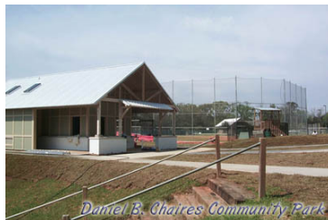
Daniel B. Chaires Community Park