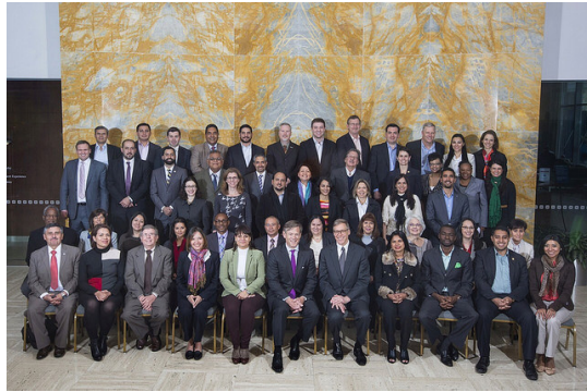
ACE 3 participants visiting the Mayo Clinic in Minneapolis, Minnesota

A group of 47 leaders from 22 countries began a week long tour of North-Central Florida today, which will end in Tallahassee this Friday. The Americas Competitiveness Exchange or ACE8 Tour is designed to showcase the wide range of innovative research, entrepreneurs and businesses in our area and to establish relationships for future research and economic development.