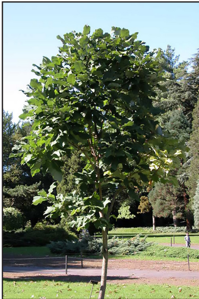
Ashe Magnolia ( Magnolia ashei )

The Ashe magnolia is a small tree, usually less than 30 feet tall with spectacularly large deciduous leaves. The leaves are light green and smooth above, the lower surfaces chalky-white. The fragrant flowers are creamy-white, large about 12 inches in diameter at full bloom. This tree, sometimes called a shrub, inhabits open, or dense, upland deciduous woods, steepheads and bluffs.