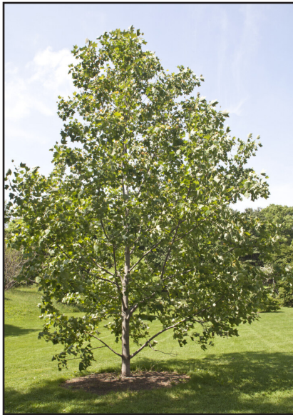
Yellow-Poplar or Tulip Tree (Liriodendron tulipifera)

The yellow-poplar is a tall native tree with a pyramidal or ovate crown. The flowers on this tree are sometimes unnoticeable due to the height of this tree, large in size with greenish-yellow and each with a blotch of orange. The yellow-poplar occurs in low woodlands, swamps, bays, along small streams, or on stream slopes. It is sporadic in eastern north Florida more common in west Florida. Distinguished most of the year by bright green leaves which turn bright yellow in the fall and drop off in the winter due to its deciduous nature.