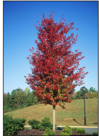
Red Maple (Acer rubrum)

A large tree with handsome, lustrous foliage the Shumard oak has thick bark with deep dark fissures and grayish scaly ridges. Distinguished most of the year by dark green leaves which turn dark red in the fall and drop off in the winter due to its deciduous nature. In northern Florida, the Shumard oak occurs locally in mixed hardwood forests of hammocks or on rich wooded slopes often where the soil is underlain by limestone. There are natural records of this tree in Marion, Levy, Columbia, Jefferson, Leon, Wakulla, Gadsden and Jackson counties. Although this tree naturally grows intermixed with a variety of other hardwoods, this is a tree of surpassing beauty.