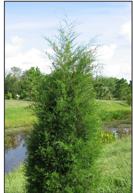
Southern Red-Cedar ( Juniperus silicicola )

This handsome shrub or small tree has showy red flowers which bloom in early spring. It is normal for this plant to drop its leaves by the end of summer. When in bloom, the tree is a magnet for hummingbirds and butterflies, while the entire shrub is a host plant for 37 species of Lepidoptera (butterflies and moths) larva.